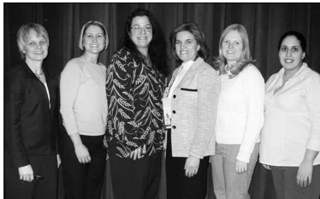
The members of McAvinnue’s Sustainability Team bring a broad range of skills and perspectives to their work.

The school recently took a significant step to sustain Open Circle at the school. Five staff members with a variety of roles formed a Open Circle “Sustainability Team” and participated in Open Circle’s year-long Sustainability Program. Funded by the